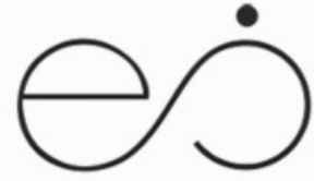
Elite eSports of India